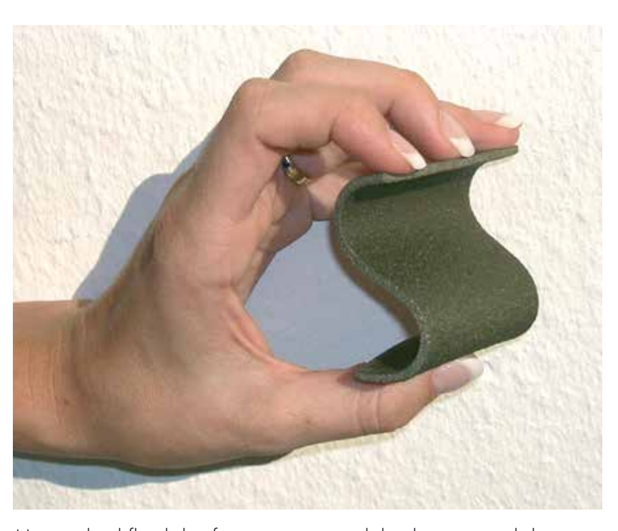
Unmatched flexibility for superior crack bridging capabilities