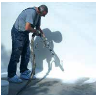
Spray application of a swimming pool